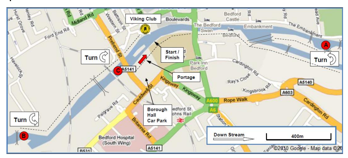
Figure 1 - Event Location Plan